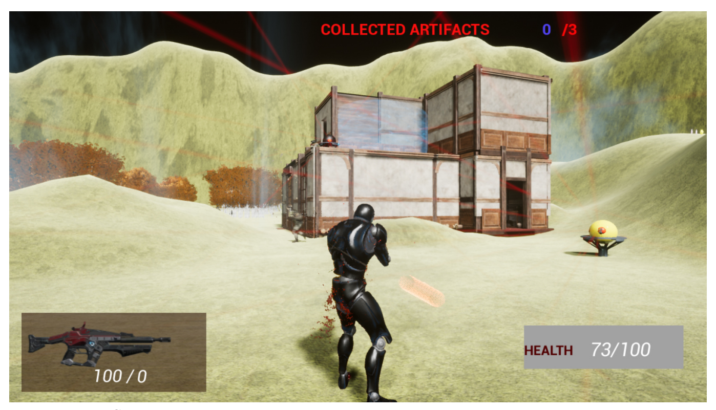
UPDATE 1 : New level added. Dark Town level. Totally now 8 levels. Also fixed so player can pause game by pressing P-button

5\10. 10/10 game, would get cancer again!. what a neat guy with some cool clothes am i right fellows. would be a good game if the sound actually worked (yes its definitely not a problem my end). For the price of a Starbucks Double Chocolatey-Chip Frappucino, this game is more than worth it. This game incorporates vertical combat that you won't be able to find anywhere else. The different weapons are fun to get to know and are all special in their own way. Gameplay is very smooth, and does not feel clunky at all.. Honestly the best game i've played. Great game! Very fun. I will play a lot. I love you dude. You are very cool. Keep up the good work.